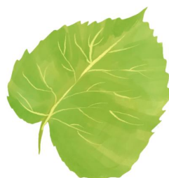
Trimnings of healthy plants

@foodcitizensg @cuifen.pui @earthtodorcas