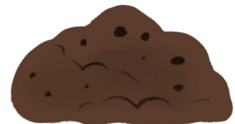
Used Coffee Ground