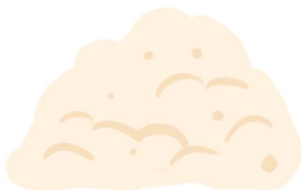
Okara (Soy Bean Pulp)