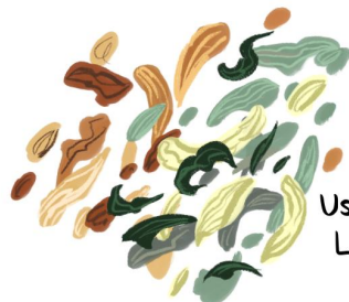
Used Tea Leaves