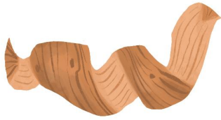
Tree Wood Shavings