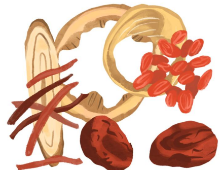
Used traditional Chinese medicine herbs