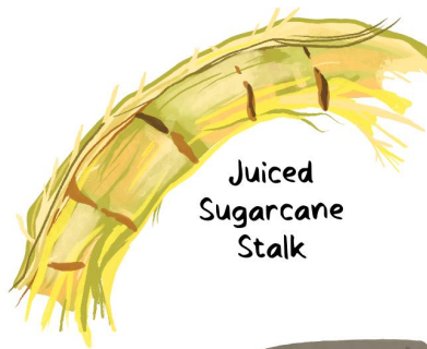
Juiced Sugarcane Stalk