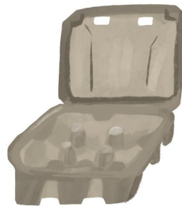
Paper Egg Tray