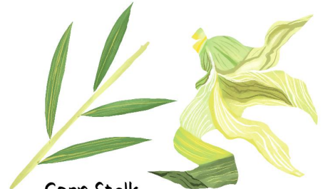
Corn Stalk & Husk